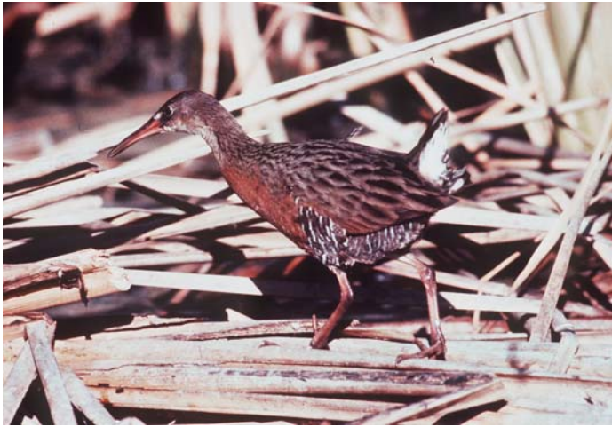
Yuma clapper rail

Pabco Road during the 1998 southwestern willow flycatcher surveys. Despite annual systematic surveys since 2000, only two more clapper rails have been detected along the Wash since 1998 (Table 1). Qualitative observations of habitat conditions over the years indicate that the construction of erosion control structures has continued to increase the quantity of potential Yuma clapper rail habitat within the boundaries of the park.