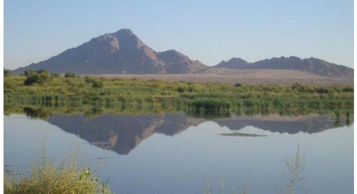
View across the largest pond looking towards Sunrise Mountain.

tion" from Congresswoman Shelley Berkley prior to the event.