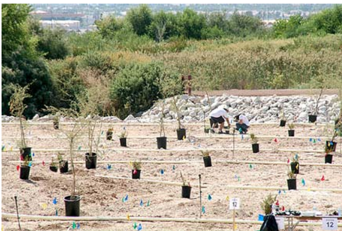
A small section of the planting area with some of the plants set out next to prepared holes. Note the irrigation lines that will be kept in-place until the plants are established.