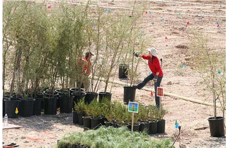
Volunteer selecting a tree for planting. With the largest variety of plants ever, the colored coded flagging system for matching plants to their holes was more important than ever.

Because of the work of volunteers, planting went smoothly. Biologists will monitor the site in the coming months to ensure growth and to plant another 10 acres around the weir. For more information about the Wash, continue to visit www.lvwash.org .