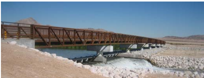
Upper Diversion bridge as seen just off the Nature Center trail running along the wash. The planting area can be seen on the right hand side of the image.