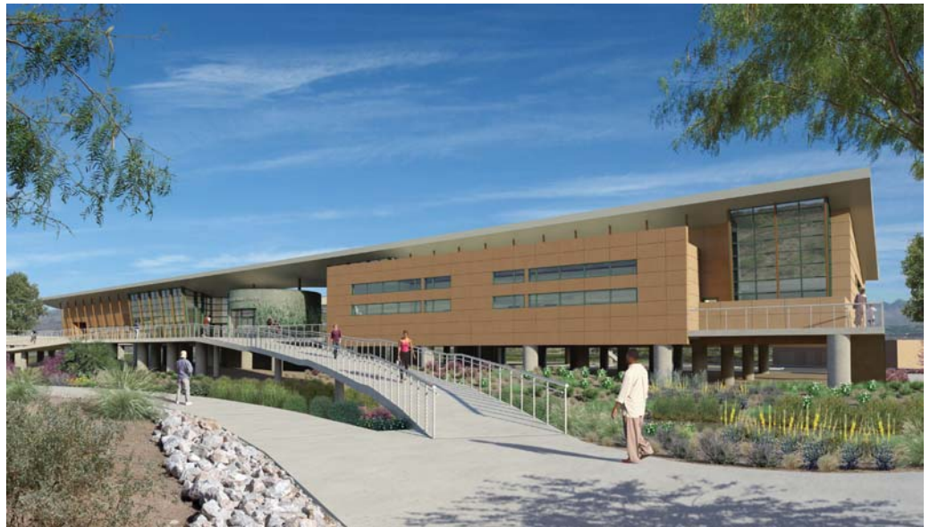
Artist conception of how the completed Nature Center will appear as viewed from the existing nature center paved trail.