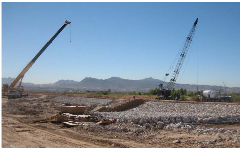
Upper Diversion by-pass site construction at the location where the bridge crossing to the Nature Center will be built. Viewed from the northeast side of the Wash.